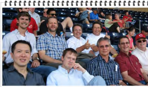
Global IT meeting at Durham Bulls Game.

Our annual Geek Week was held in May this year. After furlough I wasn't anxious to fly across the Atlantic again. But, I made it in one piece and enjoyed the time with other IT guys from around the world.